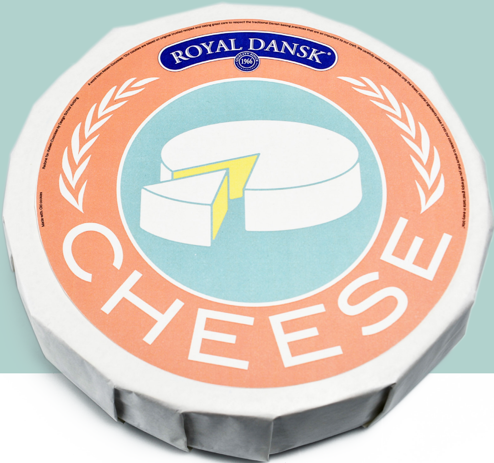
ROYAL DANSK CHEESE 908g of Danish butter cookies in gel wax